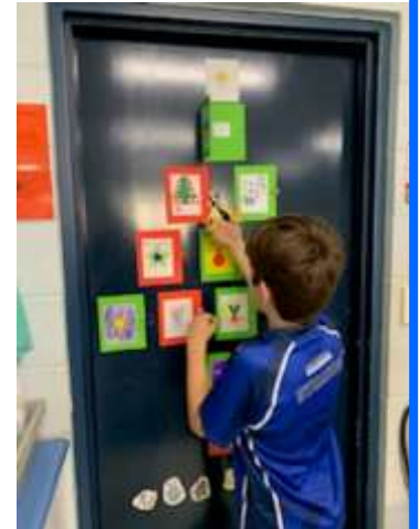
Exploring acids and bases: